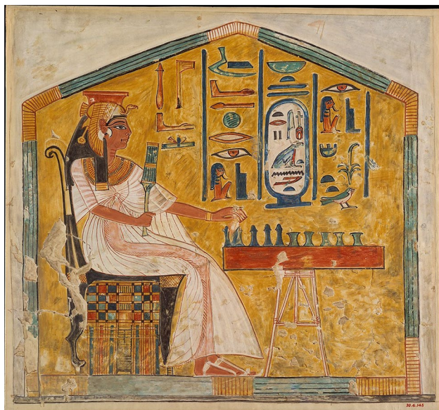
Fig. 1 Queen Nefertari playing Senet (c.1279–1213BC)

played has ever been found. Historians have had to piece together probable reconstructions from clues found in hieroglyphic art and their knowledge of ancient Egyptian culture, and the game is played today according to a variety of contrasting rule sets.